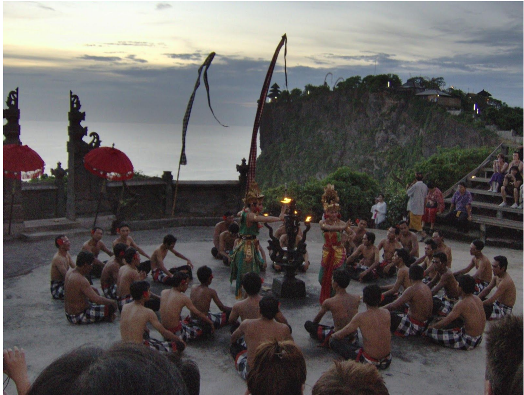
Kecak Dance (CC BY-SA 3.0)

The Kecak dance, or 'Tari Kecak', is a captivating traditional Balinese art performance, which also goes by, 'the monkey chant dance', and loosely 'fire dance', for its occasional use of fire as a centrepiece prop. The Kecak was created around 1930 and is now internationally recognised as one of Bali's top-three signature dances (alongside the Barong and Legong). The Kecak dance is unique in that it has no other musical background or accompaniment besides the chanting of male dancers, intoning a "keh-chack" polyrhythmic choir during most of the performance. Kecak's storyline is taken from the Ramayana Hindu epic and it's often on the entertainment schedule of almost every Balinese arts and culture venue. The best place to watch Tari Kecak is Uluwatu Temple.