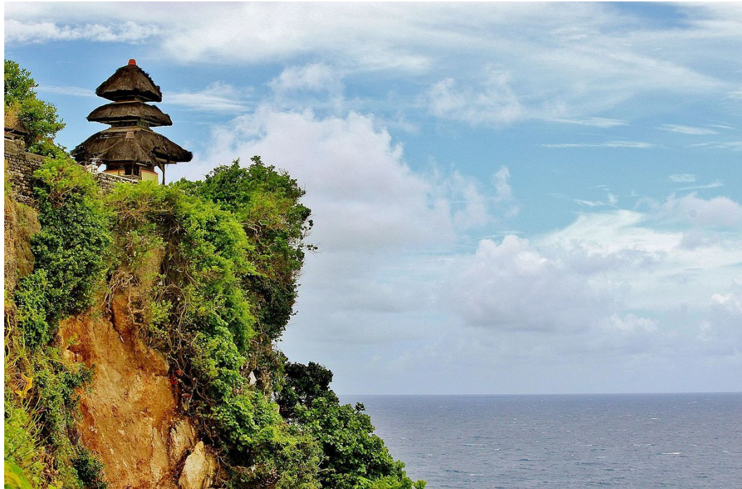
Uluwatu Temple (CC BY-SA 3.0)

Balinese temple to the sea gods, with a commanding view of the ocean high on a cliff. The temple is part of a series of temples built to protect the island from evil spirits and is the permanent home to a family of friendly monkeys. After exploring the temple and watching the sunset, experience one of Bali's most famous cultural performances, the Kecak Fire Dance. Watch the Balinese act out a scene from the Ramayana with a mesmerizing trance chant, punctuated by exciting fire dances by performers in intricate costumes. An unforgettable evening of Balinese culture that the whole family can enjoy.