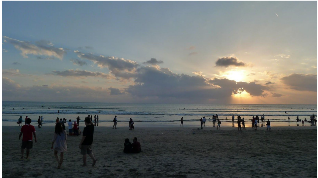
Sunset in Kuta Beach (CC BY-SA 3.0)

Kuta Beach's 2.5-kilometre stretch of cream-colored sand borders Legian to its north and Tuban (home of the Ngurah Rai International Airport) to its south. This beach on Bali's southwestern coast is perhaps the most popular resort area in Bali, and it's even more recognised among international visitors than the island itself – thanks to its combined features of sun, sand and surf. Surfing in Bali, often considered a key contributor to the rise of tourism in Bali, all started here.