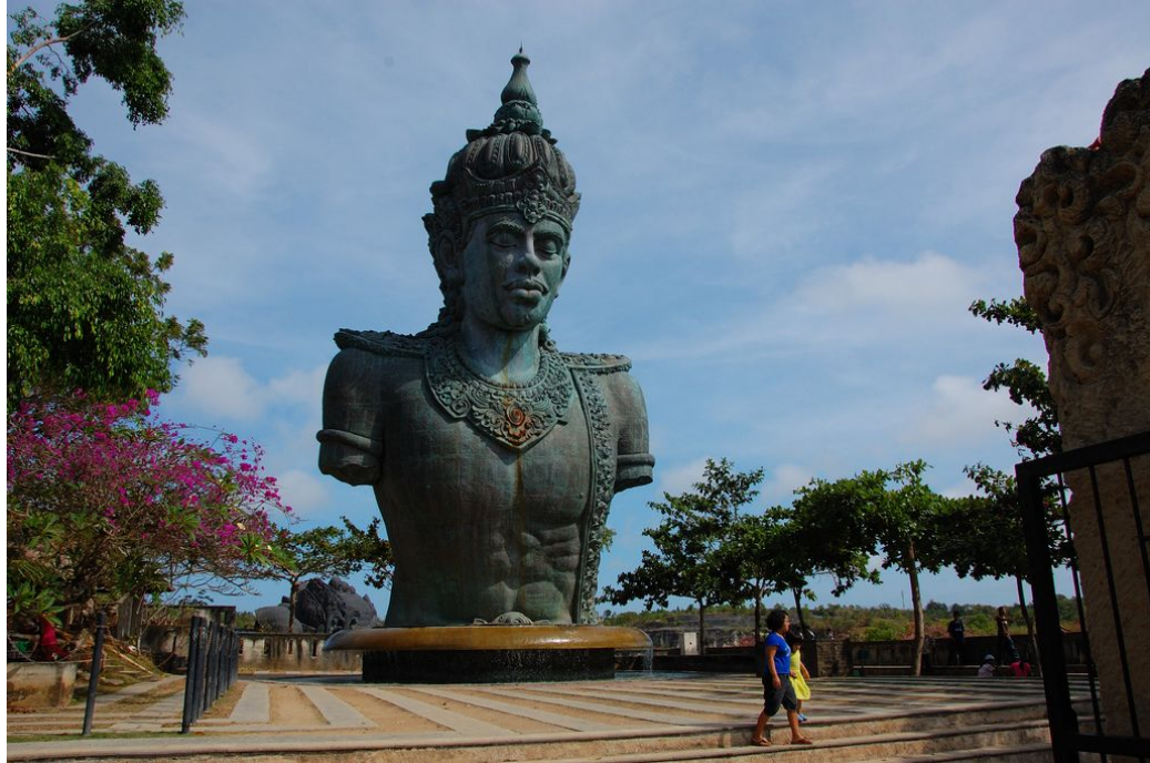
Garuda Wisnu Kencana

Garuda Wisnu Kencana Cultural Park is a cultural park located in Ungasan, Badung Regency. GWK Cultural Park offers a lavish Indonesian cultural heritage for years to come with the upcoming monumental Garuda Wisnu Kencana Statue as the Indonesian Icon of civilization, the number one cultural icon in Bali. Garuda Wisnu Kencana statue is the symbol of God Vishnu riding the great Garuda as his trusted companion. The statue is designed to be one of the world's largest and highest monumental statue in the world. Total height of the statue is 120m, consists of 24 segments and formed with 754 modules made of copper and brass coated patina acid. More info http://gwkbali.com/ .