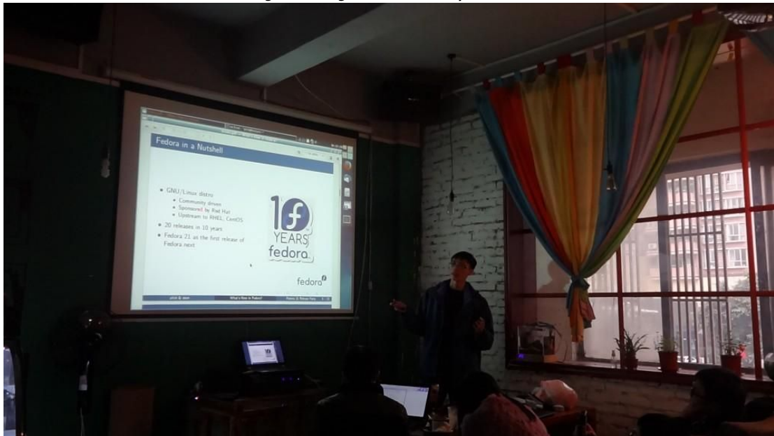
Salons in cafe