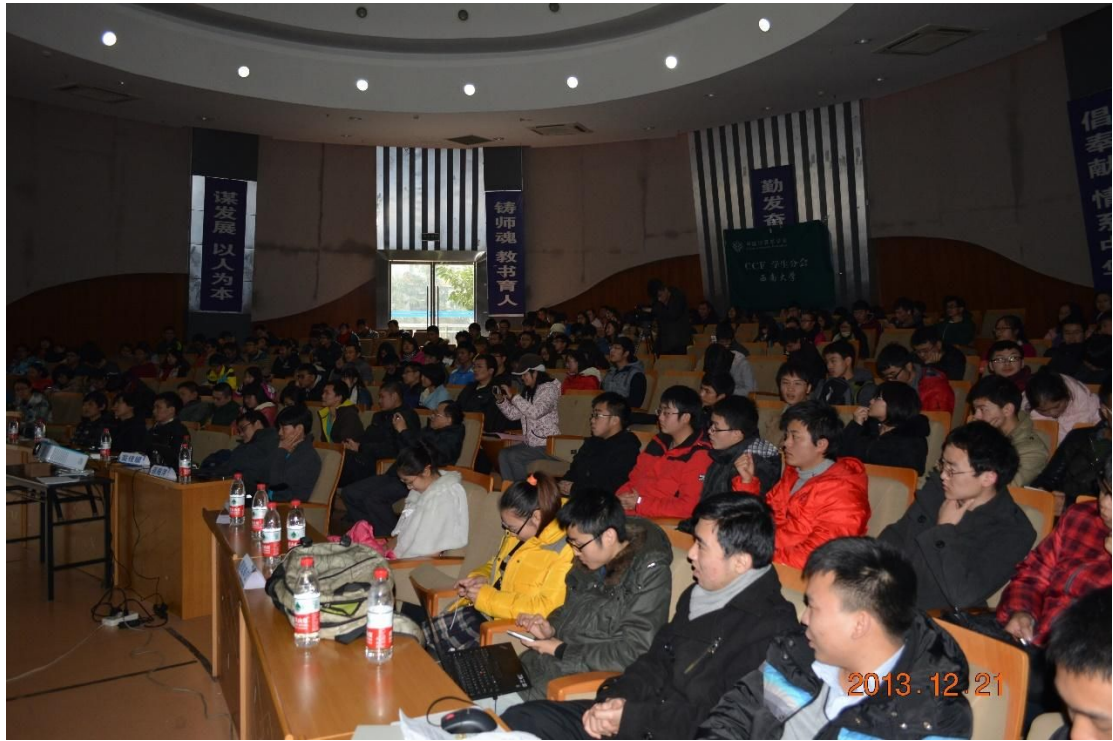
ezgo summit 2013 (about 300 people)