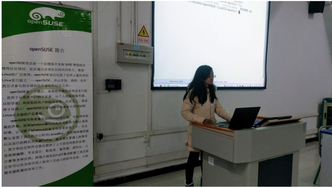
openSUSE 42.2 Release Party ( about 50 people )