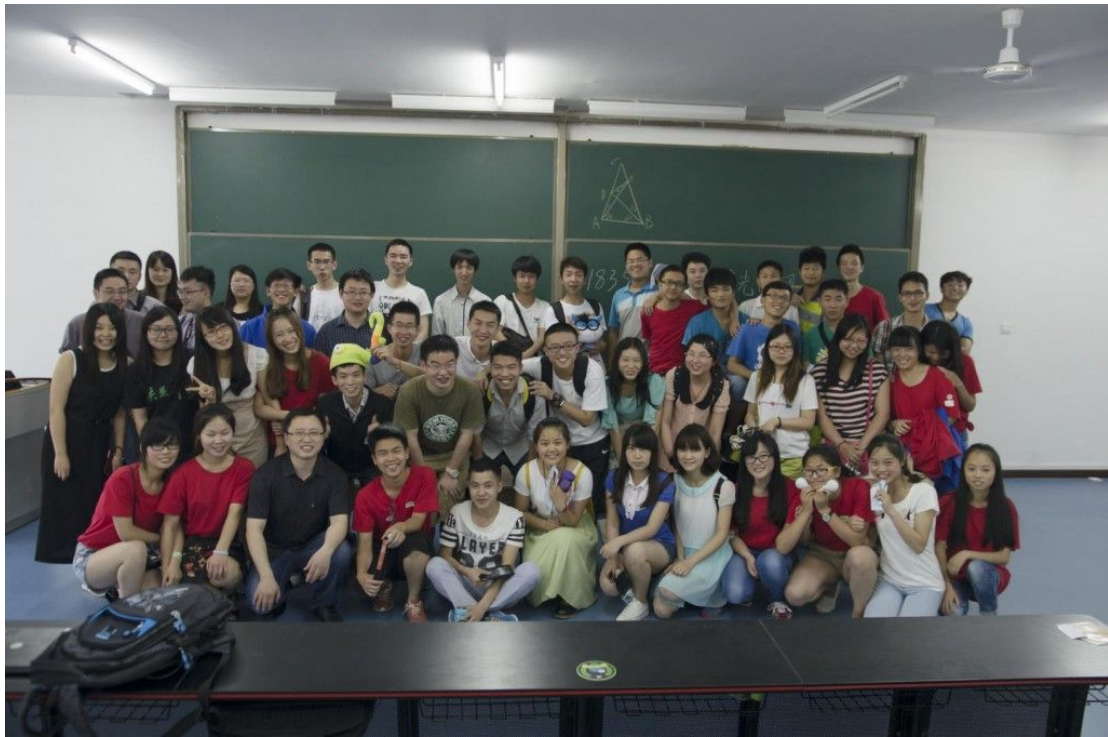
The Door of Opensource 2015 (about 200 people)