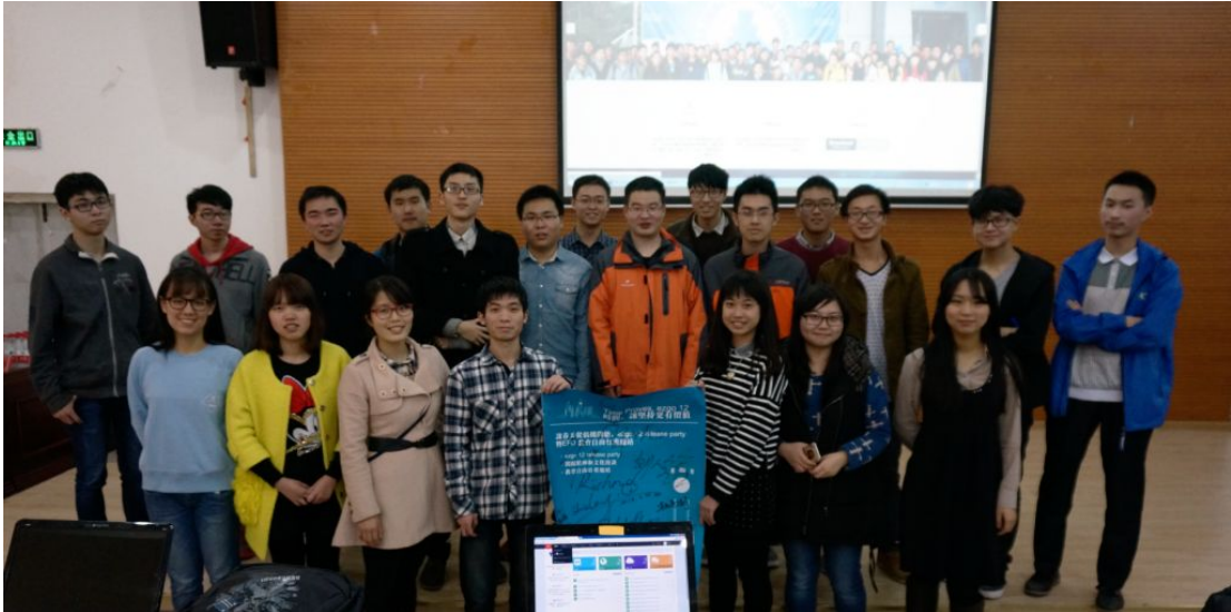
Salons in universities