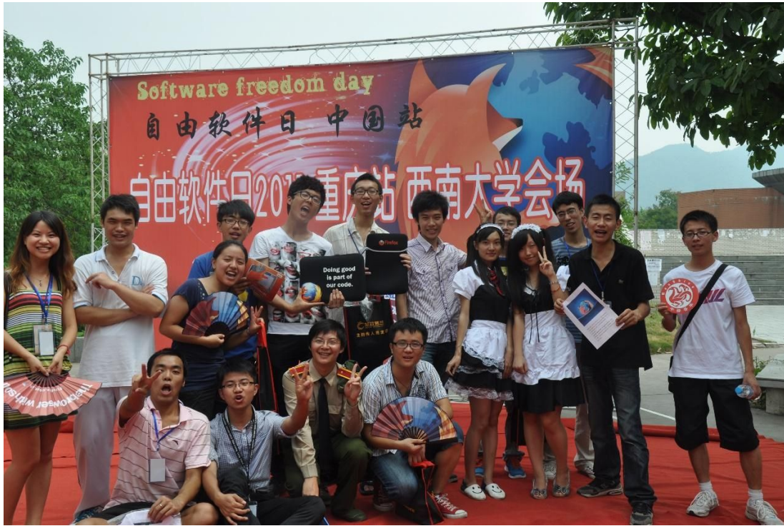
Software freedom day event